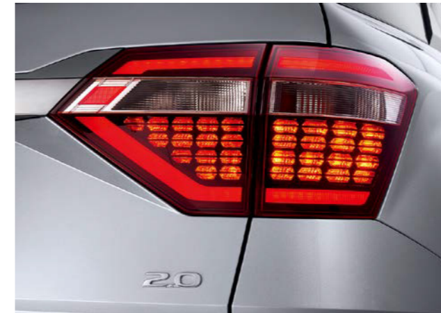
LED rear combination lamp