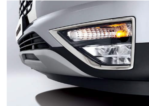
Front fog lamps (LED MFR)