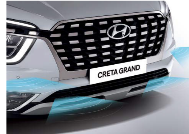
Front distance warning