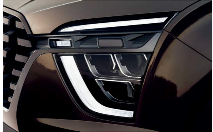
LED headlamps with LED DRLs