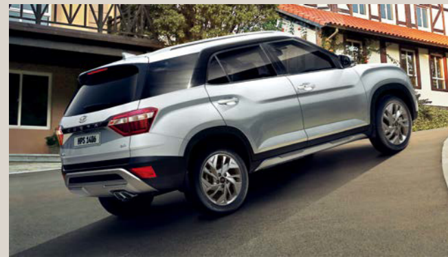
Hillstart Assist Control

TPMS helps you achieve optimal fuel economy and extends tire life by alerting you if the tires require attention.