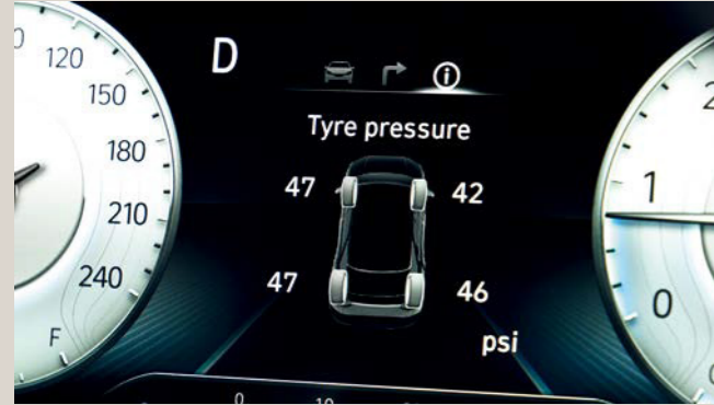
Tyre Pressure Monitor System (TPMS)

The Blind Spot View Monitor always looks over your shoulder and will alert you if you try to make an unsafe lane change.