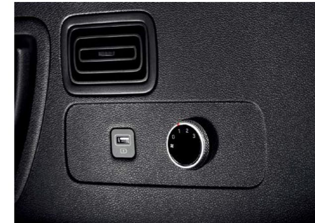
Front-row AC vents with 3-speed fan control

* Features and specifications vary by market. Please consult your local dealer.