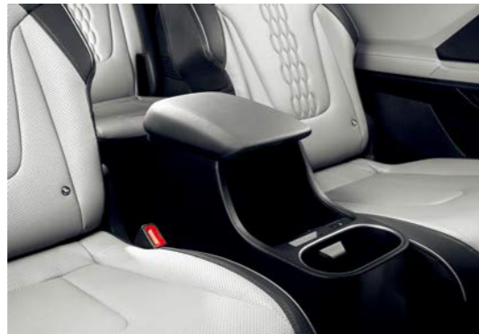
2nd-row console box (7-seater)

The large luggage space will fit just about anything. And if it doesn't fit, you can easily triple the storage space by folding down the 2nd-row and 1st-row backrests—it's as easy as 1-2-1. Now that's versatile!