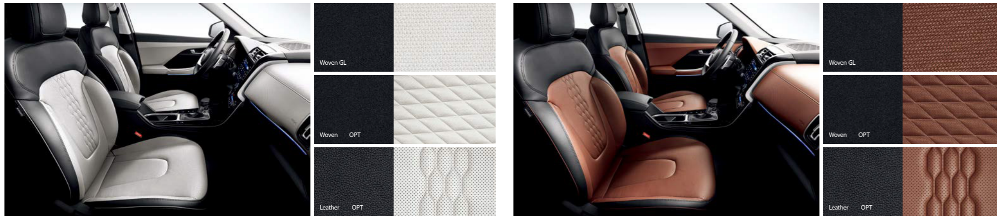
Black / Gray two-tone interior