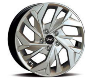
14 Alloy wheels