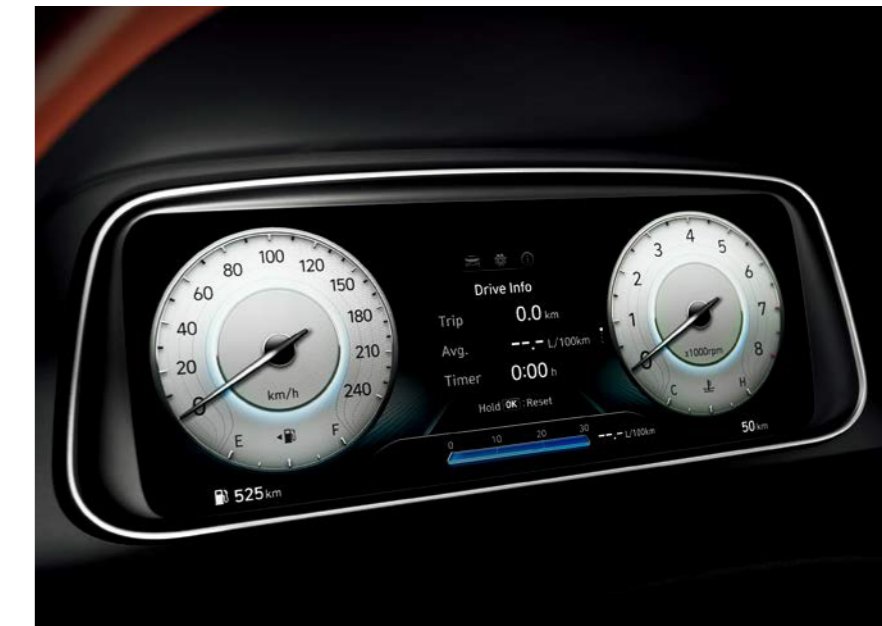
1x10 TFT LCD cluster