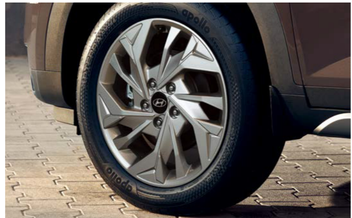
18 diamond-cut alloy wheels