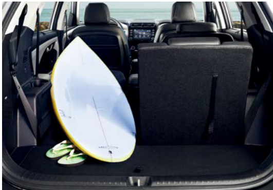
Versatile storage space

The large luggage space will fit just about anything. And if it doesn't fit, you can easily triple the storage space by folding down the 2nd-row and 1st-row backrests—it's as easy as 1-2-1. Now that's versatile!