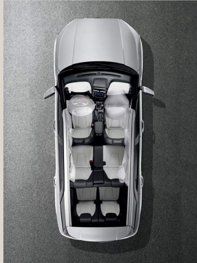
7-airbag system (Driver, Passenger, Side & Curtain)

When starting from a stop on a hill, HAC prevents the unintentional rollback that can occur after the brake pedal is released.