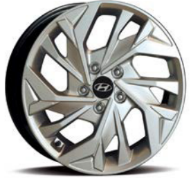
18 Alloy wheels