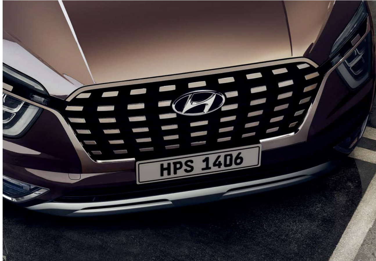
Signature cascading grille with dark chrome finish

Modern, sporty, and masculine—it's just my style, it's in perfect tune with my sensibilities, and it fits in anywhere. From any angle, CRETA GRAND projects supreme confidence and authority. Your fascination only grows as you move in closer to examine the details: The LED lighting, the strikingly-designed diamond-cut alloy wheels, and the catchy-looking radiator grille. But the real centre of attention and even greater delights await you inside.