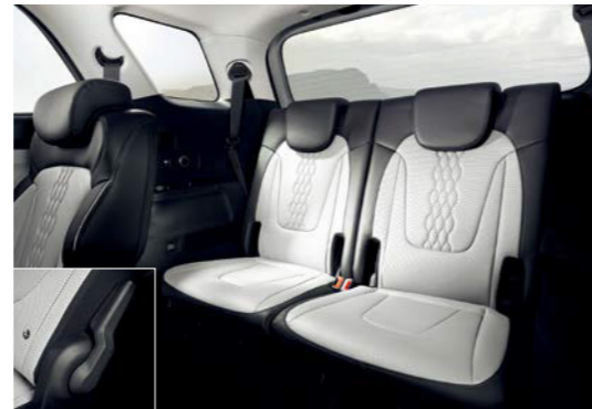
2nd row seat folding system with 1st row seats

The highly versatile center console box serves both as a padded armrest, a handy storage bin and comes with a wireless phone charger and built-in dual cupholders.