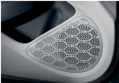
Front / Rear four-speaker system