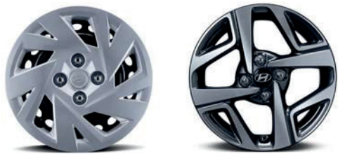
15 Steel wheel cover