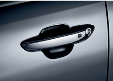
Chrome-coated door handles