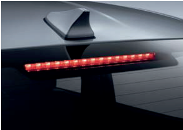
High-mounted stop lamp (LED)