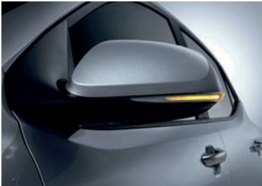
Outside mirrors & repeaters