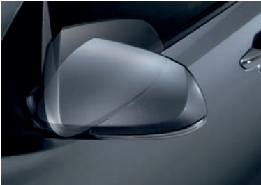
Electric folding mirrors