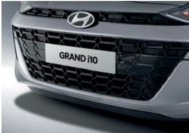
Glossy black radiator grille