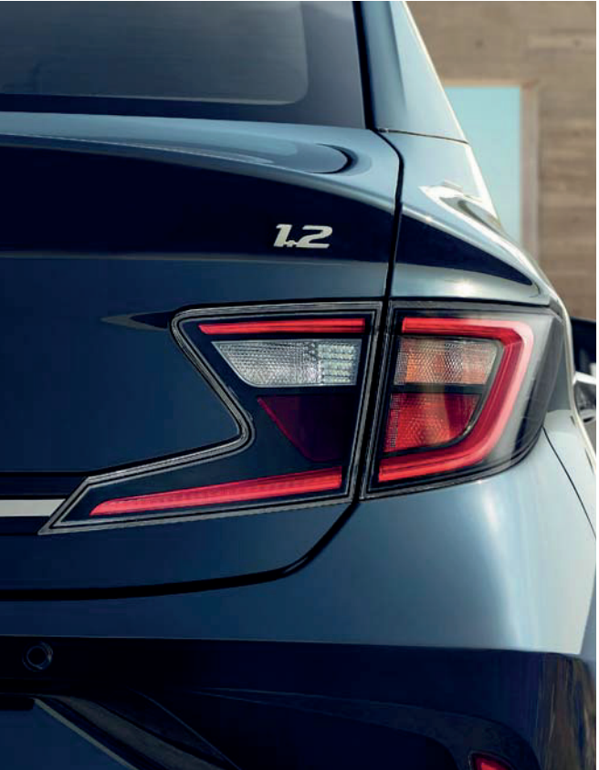
Stylish Z-shaped LED tail lamps