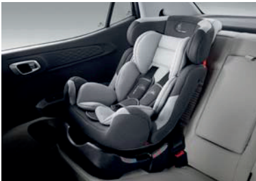
ISOFIX child seat anchor system