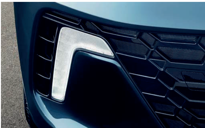
Projection headlamps LED Daytime Running Lights (DRL)