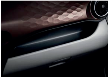
Practical storage area