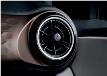
Unique propeller-style AC vents