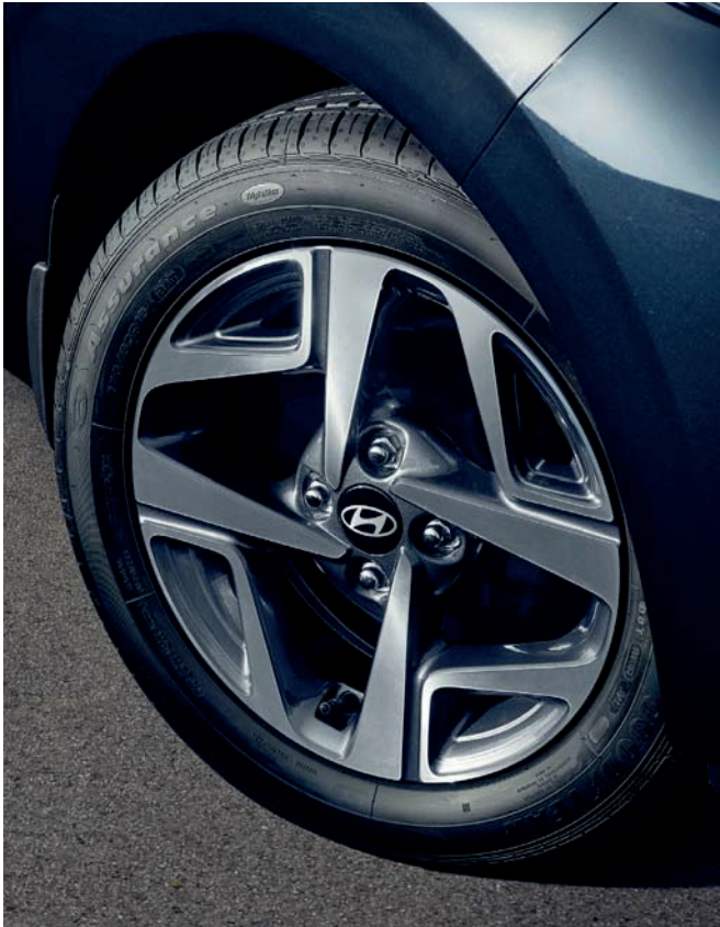
15in Diamond-cut alloy wheels