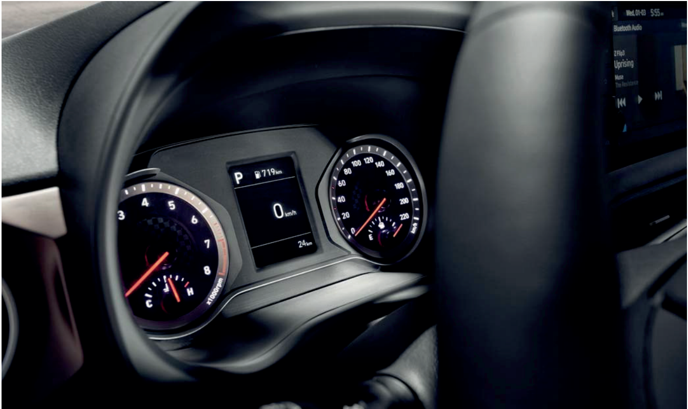
Speedometer with multi-info display

The 2.8-in LCD nestled between the speedometer and tachometer shows the basics: fuel, coolant temperature, odometer, and gear-shift position indicator, while the more capable 4.0-in LCD serves up distance-to-empty, outside temperature, average economy, and more.