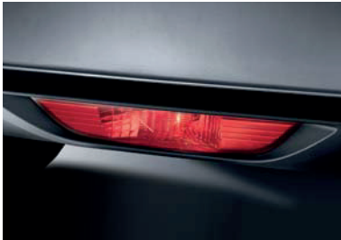
Rear fog lamps