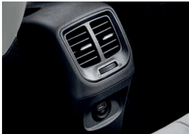
Rear AC vents