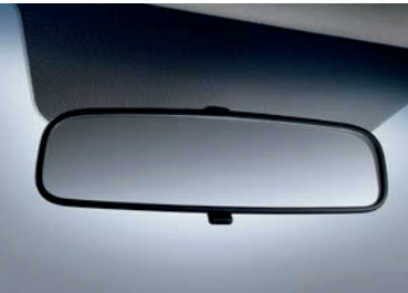
Day / Night rear view mirror